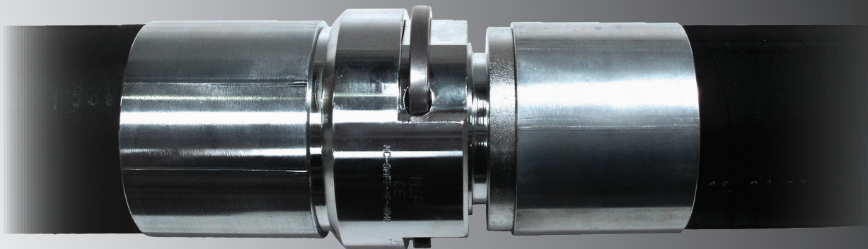
DN76 -70bar (1015 psi) FLUSHFIT

To compliment the high pressure feed line a DN76 – 70Bar Rockmaster / 2Plus return line hose assembled with the FLUSHFIT staple connection completes the circuit.